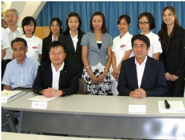
Prime Minister Abe came to interview the Vietnamese nurses of our hospital (2009)